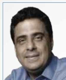
RONNIE SCREWVALA Chairperson & Co-Founder