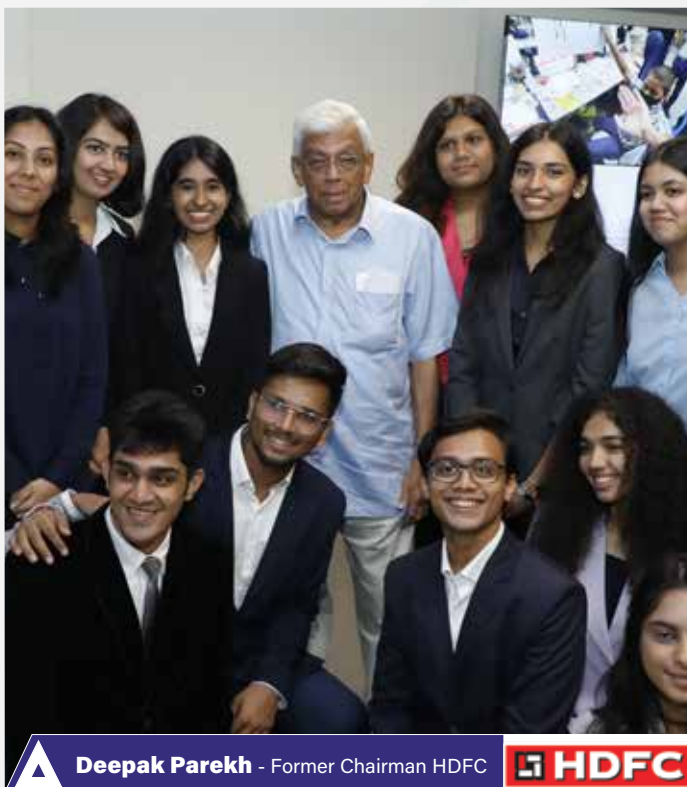
Deepak Parekh - Former Chairman HDFC

Through live deal-room simulations by seasoned investment bankers, students confront real transaction challenges from valuation to due diligence under expert supervision. This immersive model bridges academic theory with practical application, equipping you to navigate today's complex financial landscape.