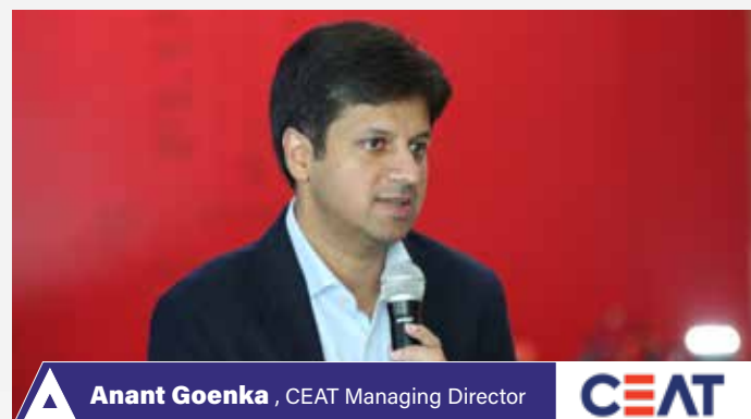
Anant Goenka , CEAT Managing Director