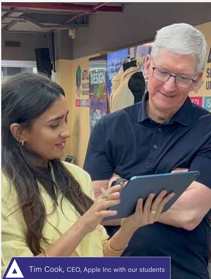
Tim Cook, CEO, Apple Inc with our students

At ATLAS ISME, you'll find the knowledge, skills, and network to grow and succeed in the ever-evolving world of business.