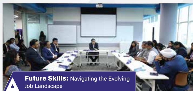
Future Skills: Navigating the Evolving Job Landscape