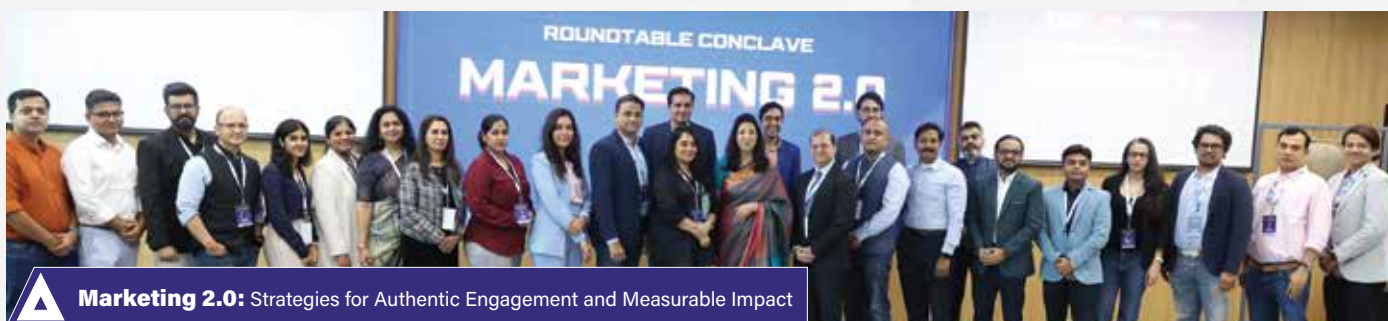
Marketing 2.0: Strategies for Authentic Engagement and Measurable Impact

Interactive forums with senior executives and regulators keep you ahead of market innovations and ESG trends.