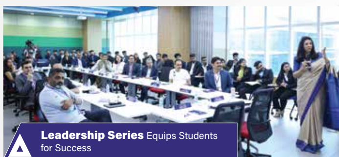
Leadership Series Equips Students for Success