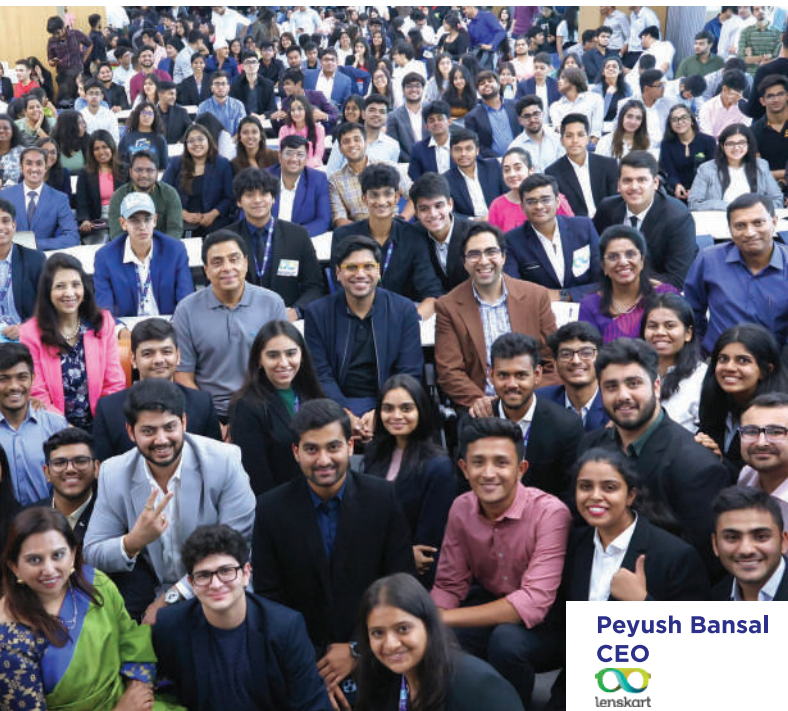
Peyush Bansal CEO lenskart