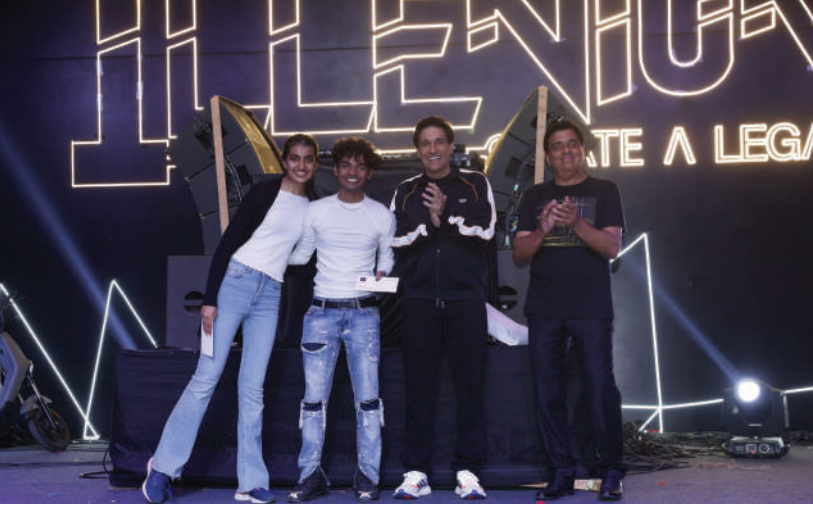
Shiamak Davar & Ronnie Screwvala