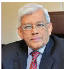
DEEPAK PAREKH Chairman HDFC