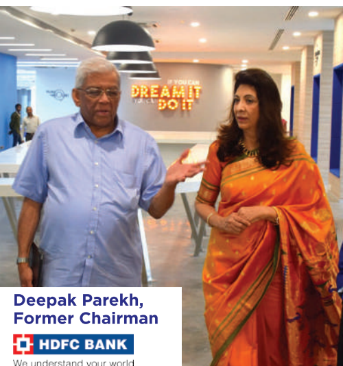
Deepak Parekh, Former Chairman HDFC BANK We understand your world

With a focus on providing our students with an exceptional educational experience that goes beyond textbooks and theories. That's why we bring industry professionals right into the classroom.