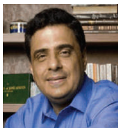
RONNIE SCREWVALA Chairperson & Co-Founder